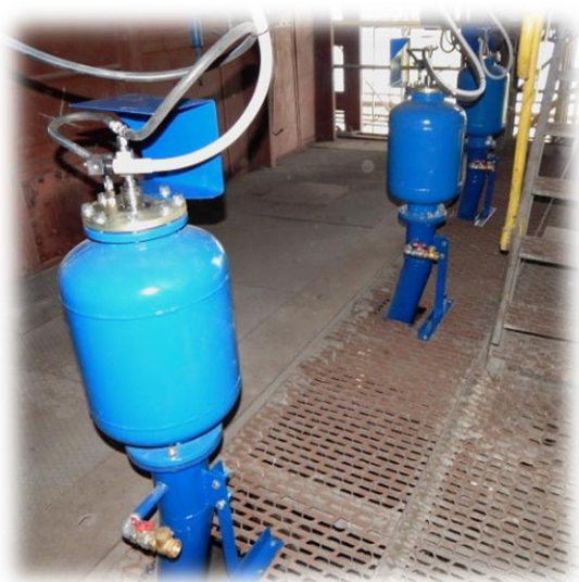
Trusted us PEC Gliwice Sp. z o.o